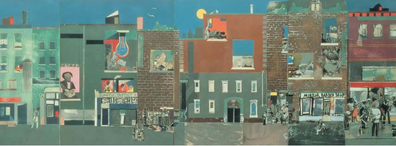
The Block, 1971 © Romare Bearden Foundation/Licensed by VAGA, New York, NY.