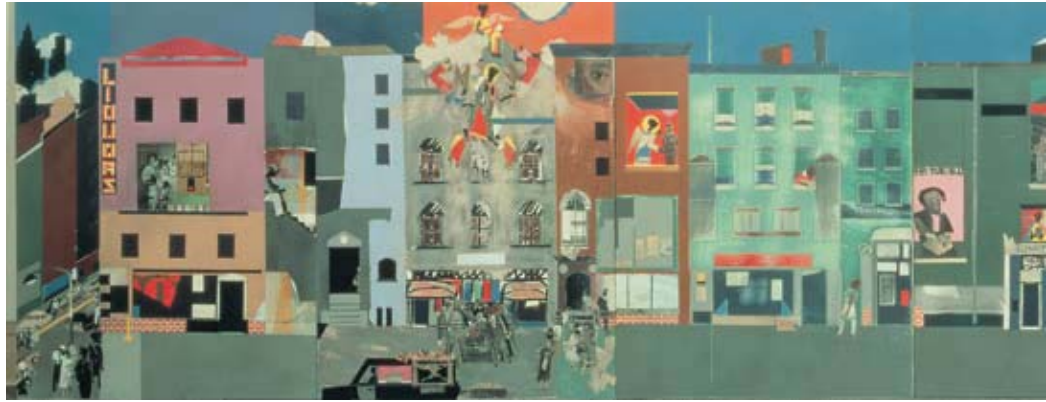
The Block , 1971 © Romare Bearden Foundation/Licensed by VAGA, New York, NY.